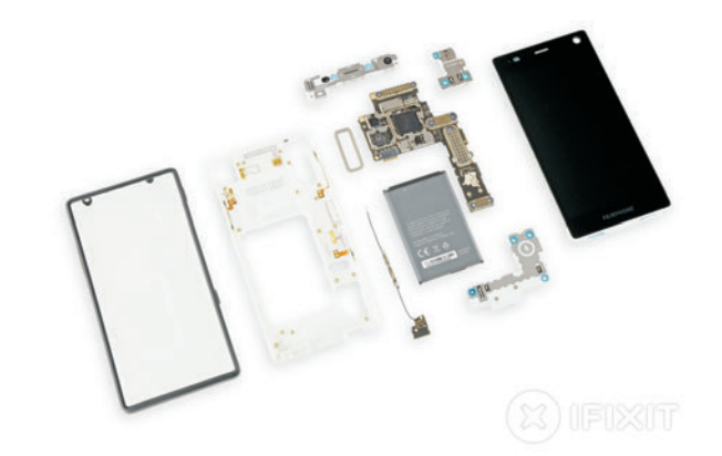
Disassembled Fairphone 2

Furthermore, new disassembly and remanufacturing processes will improve resource efficiency. This also considers development of underlying product design, production, testing and remanufacturing technologies. The practical implementation of the business models will be guided in nine case studies and future technology exploitation ensured.